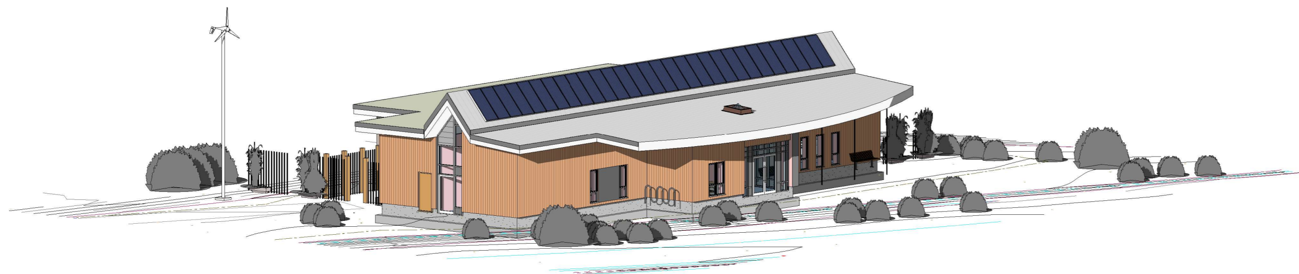
South West 3D View