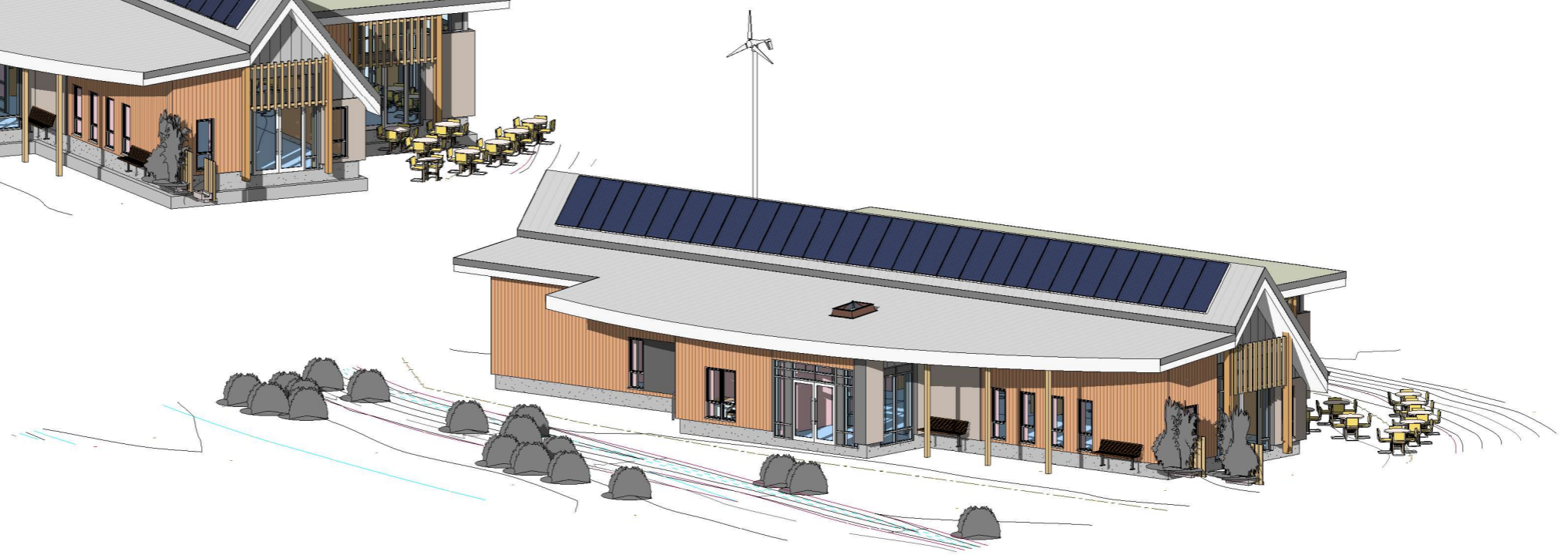
North East 3D View